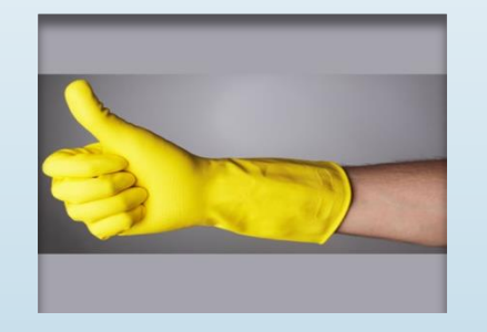
Other Safety Equipments